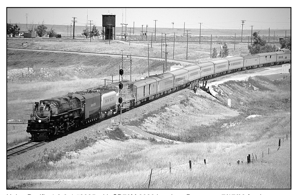
Union Pacific 4-6-6-4 #3985 with SD70M 3930 heads to Denver on 7/17/03 for the Cheyenne Frontier Days Train on 7/19/03 and the RMRRC trip on 7/20/03.

The first MK5000C with an EMD prime mover, now model MK 50-3, has a new Genesee & Wyoming owner's paint scheme, orange and black. Utah Railway 5005 was at Provo, UT, on 7/4/03. The other five units will be returning to Utah Railway service still in the red and gray scheme. Only the Utah Railway 5005 will wear the G&W colors this year. Another