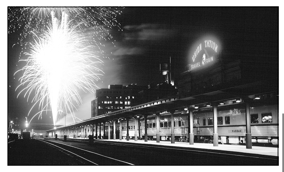
The Rockies baseball team put on a spectacular fireworks display at Coors Field on July 3, 2003. Ansco's Summer Ski Train (Saturdays only) train was on track two. Business car KANSAS was at the right. The last summer trip to Winter Park Ski Resort will be August 30, 2003.

UP will sometimes run short distance short trains of grain to specific processors like Cargill. It is not unusual to see a 25 car train loaded for Iowa Falls, a distance of under 100 miles. Usually they will move on the next train out to expedite.