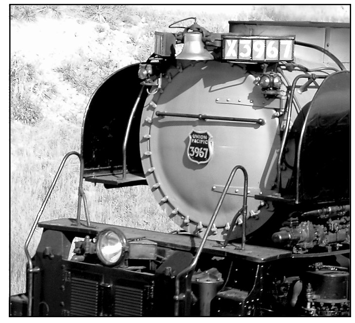
UP Challenger #3967 leading our train. - Photo © Ray Kilcoyne.

The further north we traveled, the cloudier and cooler it became. After Carr it rained. The train crew was concerned we would be having our first photo run-by in the rain so they stopped short to do a double. But rain came down and soaked us all. Only the very smart passengers on the train escaped.